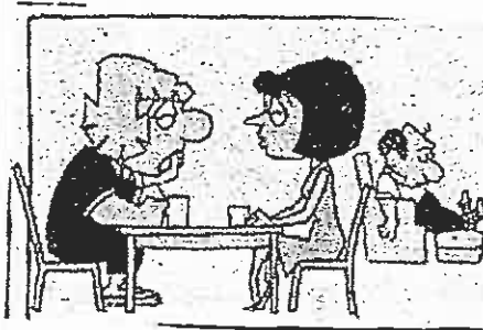
"To make a long story short, I married the lowest bidder."