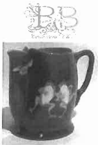
3 5/8" Pinched Spout Pitcher of the Dancing Frogs $113.50