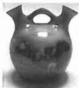
Sheep Vase/Toothpick Holder $31.00