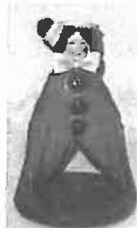
7" Figural Candle Holder $627.77