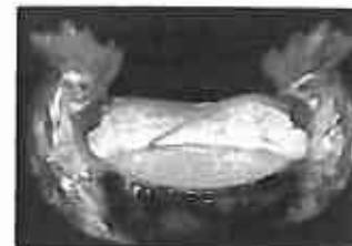
Dueling Roosters Condiment Dish $327.00