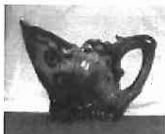
Perched Butterfly Milk Pitcher $868.66