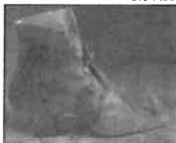
3 1/4" Pink Rose Tapestry Shoe $311.66