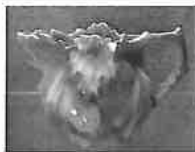
4 1/4" Maple Leaf Milk Pitcher $375.00