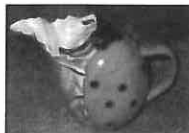
Ladybug Water Pitcher $1,932.77