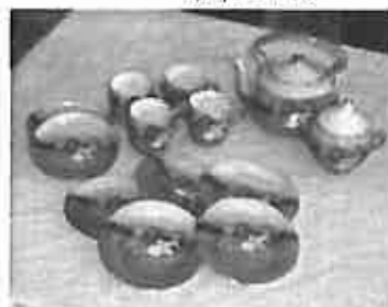
Child's Tea Set of Ring Around the Rosey $268.20