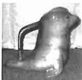
Seal Water Pitcher $1,802.00