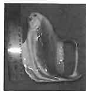
5" Flounder Milk Pitcher $1930.00