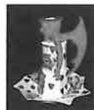
7" Large Devil & Card Chamberstick $7,100.00