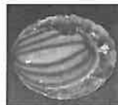
Watermelon Luncheon Plate $88.00