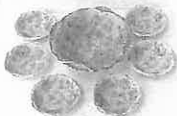
Rose Tapestry Berry Bowl Set $405.00