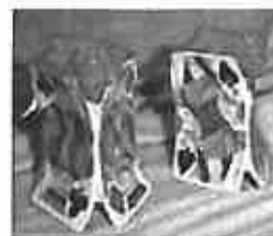
3 1/8" Devil and Cards Salt & Pepper Shakers $355.00