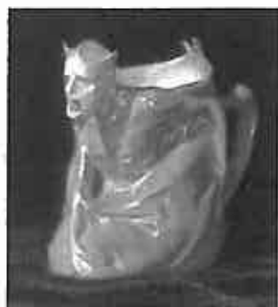
3 3/4" Red Devil Creamer $430.77