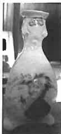
7 1/4" Jester Handled Candle Stick $438.99