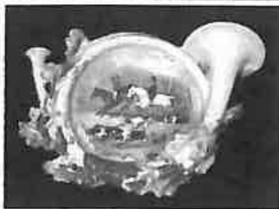
Whimsical Horn with Hunt Scene $237.80