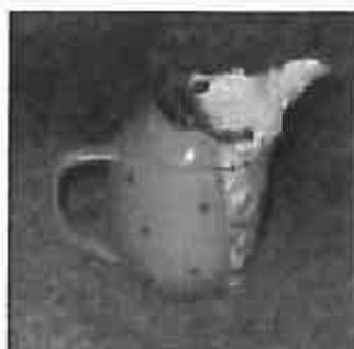
Ladybug Milk Pitcher $2,191.16