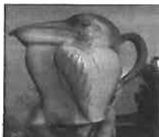
6" Pelican Water Pitcher $355.00