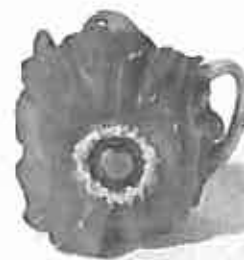
7" Red Poppy Covered Mustard Jar $95.00