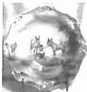
10 1/2" Bowl of Man with Donkey $975.00