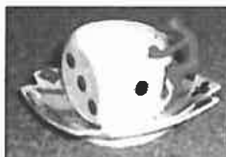
Devil Dice Cup and Card Saucer $257.00