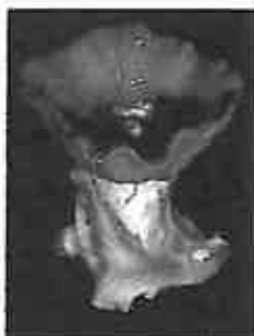
Red Poppy Hat Pin Holder $438.99