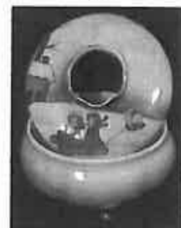
Hair Receiver of Snow Babies Sledding $128.49