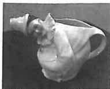
Yellow Clown Milk Pitcher $500.00